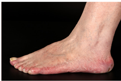
How a cracked heel can look