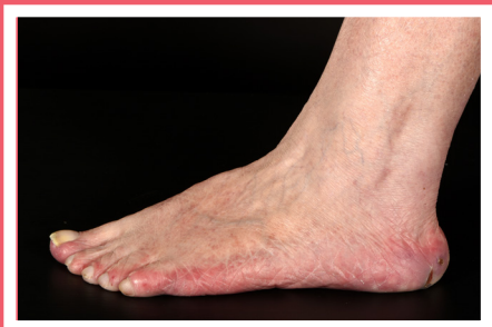
How a cracked heel can look