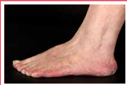
How a cracked heel can look